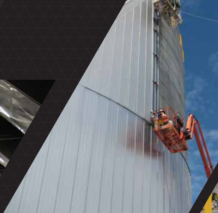
Standing Seam tank insulation system