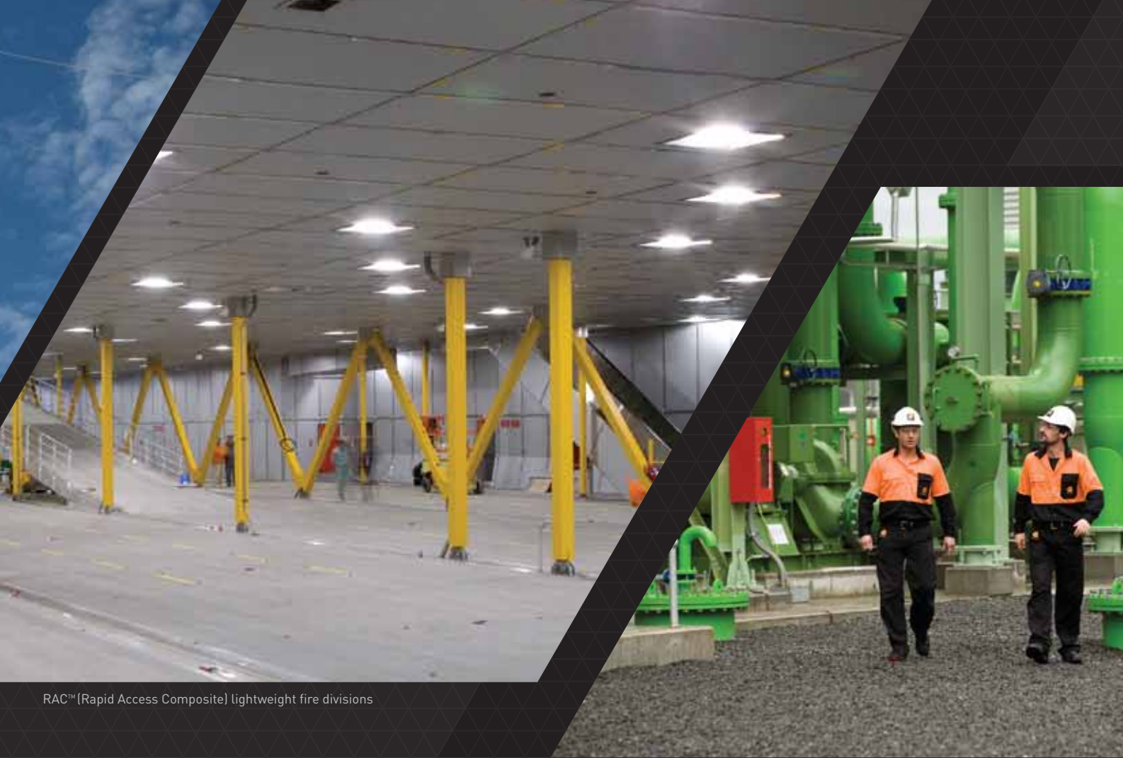
RAC™ (Rapid Access Composite) lightweight fire divisions